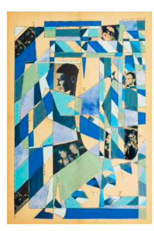
3. The Bands of Pride (2017) © Hormazd Narielwalla