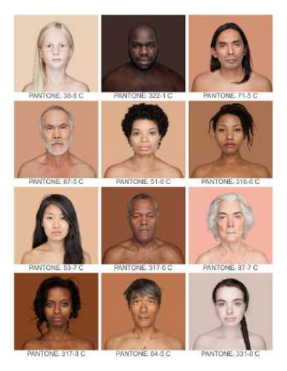
1. Humanae (work in progress since 2012)© Angélica Dass