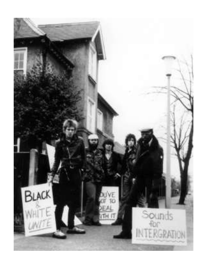
4. Black & White Unite (1978)