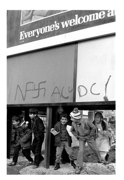
4. From 100 Images of Migration

5. Wanderers, from Call Me by My Name