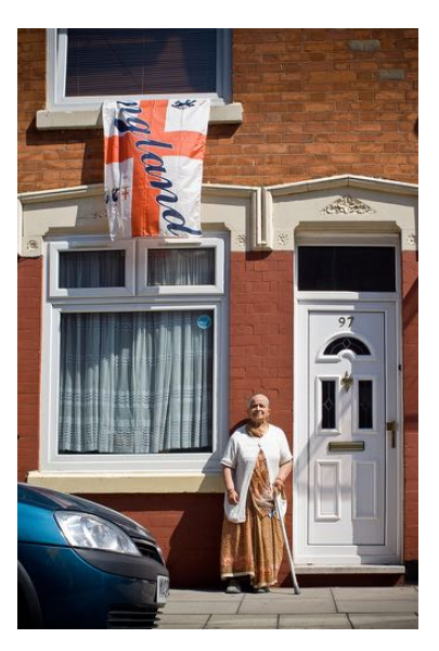
3. From 100 Images of Migration